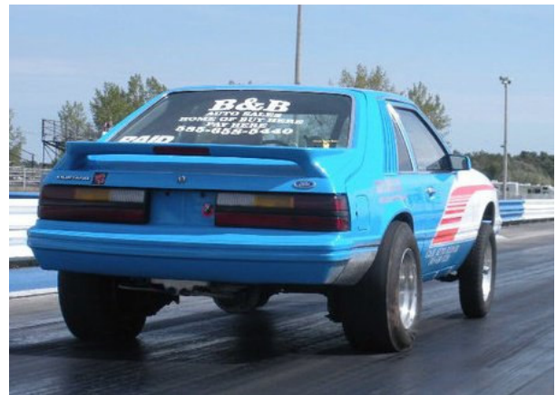
Chuck Hoehn – Power Adder Champ

Power Adder Champion, Chuck Hoehn had a great year in his red, white, and blue hatchback. His current combo is an RV Engines built 347 with 11:1 compression and a custom ground cam. This is backed with a C4 transmission and pushed to an oversized pair of slicks through 4.10 gears. Chuck's best pass to date is 9.77 @ 139mph on a 175 shot of NOS!!! This winter's projects have included some safety upgrades. What can we expect new in 2011? MORE NOS!!!! How about a 300 shot? He's hoping that upping the juice might shave a couple tenths off that time and maybe a couple more miles per hour!